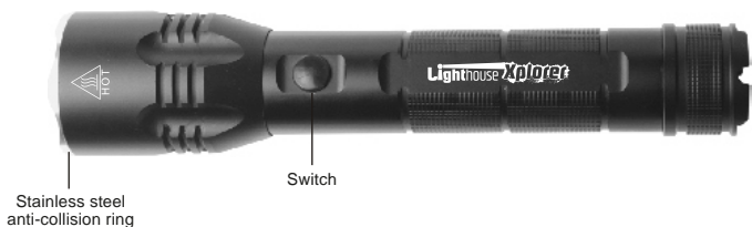
Stainless steel anti-collision ring

The Lighthouse Xplorer range of torches are designed to the highest specification using the best materials to produce torches that are solid, durable, reliable and intended for rugged outdoor activities. Each torch provides a long lasting and powerful source of light and are ideal for use in both professional and leisure activities.